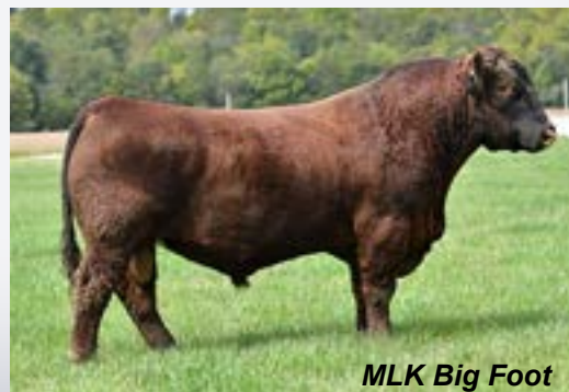
MLK Big Foot