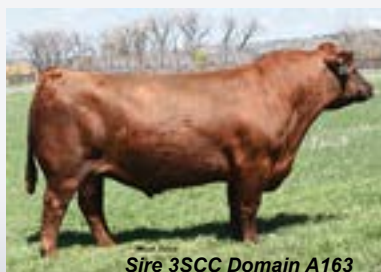
Sire 3SCC Domain A163