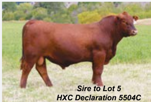
Sire to Lot 5 HXC Declaration 5504C

Consigned by HORNUNG RED ANGUS Andy & Alisa Hornung • Cottage Grove, WI • 608-513-7610