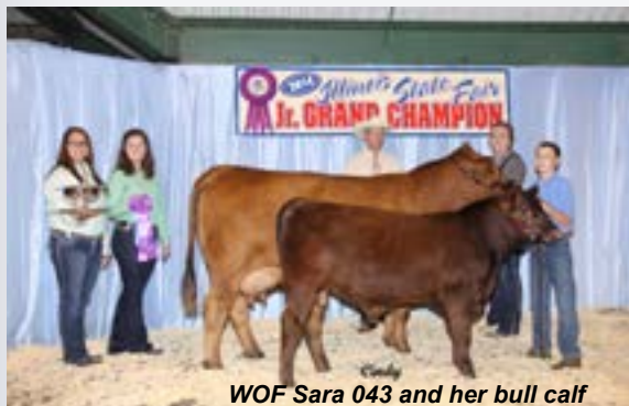
WOE Sara 043 and her bull calf