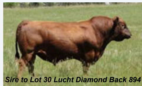
Sire to Lot 30 Lucht Diamond Back 894