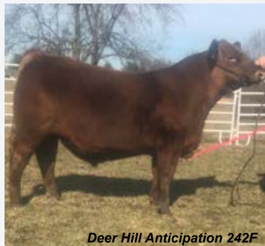
Deer Hill Anticipation 242F

This girl here has it! Her dam is a direct daughter of the great DAMAR MIMI W085. Should have no problem with the milking EPD here! Watch for her on sale day. Another Deer Hill Anticipation 242F progeny.