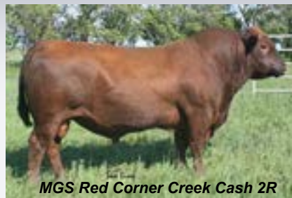
MGS Red Corner Creek Cash 2R

Virgin coming two year old bull. Son of a DAMAR MIMI W085 daughter and possibly the best bull we have ever owned, a Hamley son, DHX MAX 181Y register # (42128002) If you want to stack the pounds on your calves take a look at this guy. He's got some frame so if you want a bit of that you might want to check him out.