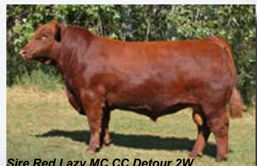
Sire Red Lazy MC CC Detour 2W