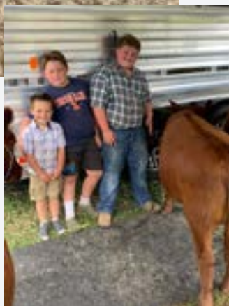
Right: Juniors at the Small Town Showdown in Taylorville, IL