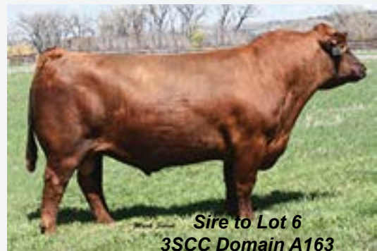
Sire to Lot 6 3SCC Domain A163

Consigned by HORNUNG RED ANGUS Andy & Alisa Hornung • Cottage Grove, WI • 608-513-7610