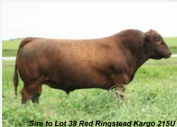
Sire to Lot 38 Red Ringstead Kargo 215U

N3 CATTLE Consigned by Peyton Nagel • Alhambra, IL • 618-301-6917