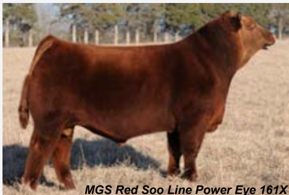
MGS Red Soo Line Power Eye 161X