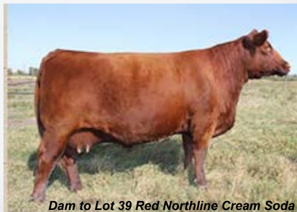
Dam to Lot 39 Red Northline Cream Soda

N3 CATTLE Consigned by Peyton Nagel • Alhambra, IL • 618-301-6917