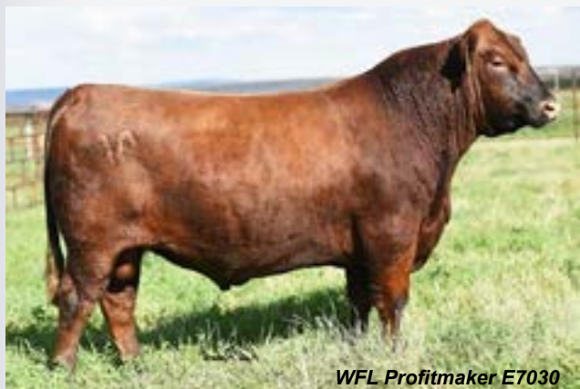
WFL Profitmaker E7030

Go to www.illinoisredangus.com for updated photos and videos.