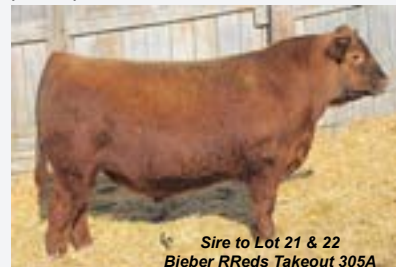
Sire to Lot 21 & 22 Bieber RReds Takeout 305A