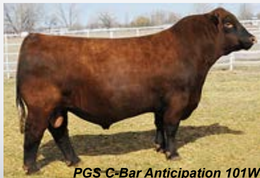
PGS C-Bar Anticipation 101W

We really love this heifer. We feel like she will make a good show heifer and an even better cow in the future. We bought the dam from Rhodes Red Angus and this cow always does her job. The sire, Deer Hill Anticipation 242F, a C-Bar Anticipation 101W son has been a rock star.