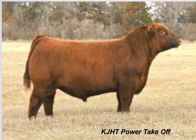
KJHT Power Take Off

Guarantee 1 pregnancy if put in by a certified tech.