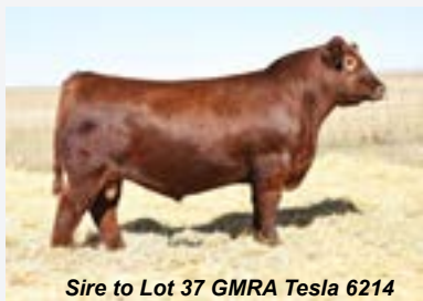
Sire to Lot 37 GMRA Tesla 6214

HORNUNG RED ANGUS Consigned by Andy & Alisa Hornung • Cottage Grove, WI • 608-513-7610