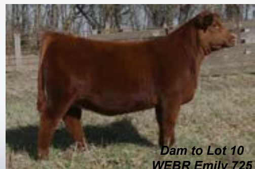
Dam to Lot 10 WEBR Emily 725

Consigned by FIVE OAKS FARM Travis Giffey • Sparta, TN • 931-260-1478