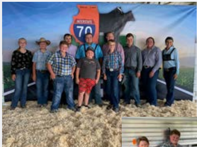
Top: Juniors at the I70 Showdown in Highland, IL

All proceeds of the following semen sale will go to the Illinois Junior Red Angus Association