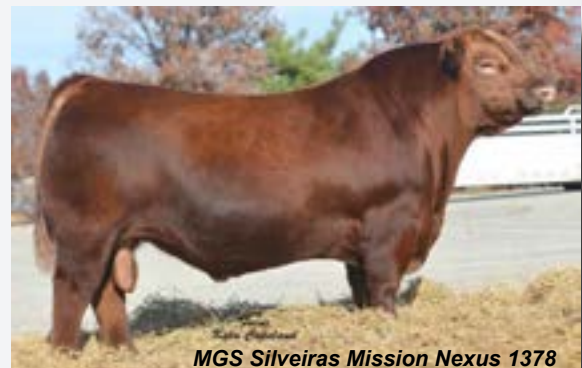
MGS Silveiras Mission Nexus 1378

Guarantee 1 pregnancy if put in by a certified tech.