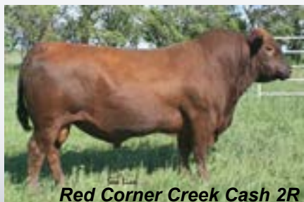
Red Corner Creek Cash 2R