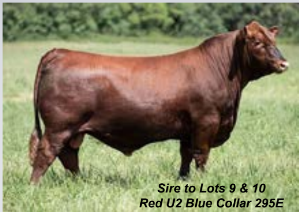
Sire to Lots 9 & 10 Red U2 Blue Collar 295E