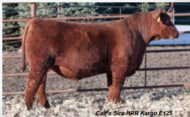
Calf's Sire HRR Kargo E125

Sharp looking cow here! This young cow is good made, neat fronted, and ready to work for your herd! TMAS Ms Evonna 757E hails from the Thomas Ranch herd in South Dakota, who is known for producing some of the highest quality stock in other breeds and is making a name for themselves in the Red Angus breed too!