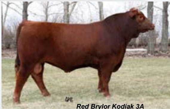
Red Brylor Kodiak 3A

Getting 1 additional #1 Embryo as a Guarantee