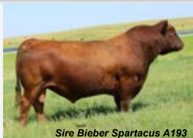
Sire Bieber Spartacus A193