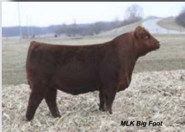
MLK Big Foot

Talk about an opportunity! Here is a chance to get genetics from either the top bull MLK Bigfoot or the proven winner PTO. It doesn't matter which package you choose, you will have success!