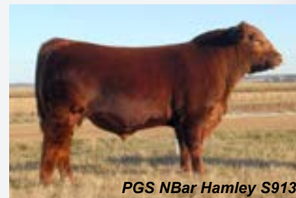
PGS NBar Hamley S913