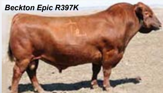
Beckton Epic R397K

Big Foot is one of the hottest bulls in the breed. He has already sired numerous champions and his semen has been as high as $420 per straw. Add this with an impressive Epic R397K daughter and you have a deep bodied, length of spine heifer that is sure to be productive in your program as well as bring home titles from the show ring. This one is hard for us to let go of, but we wanted to bring a good one to the sale!