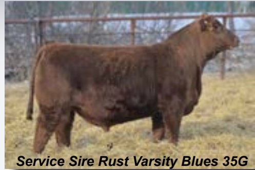
Service Sire Rust Varsity Blues 35G