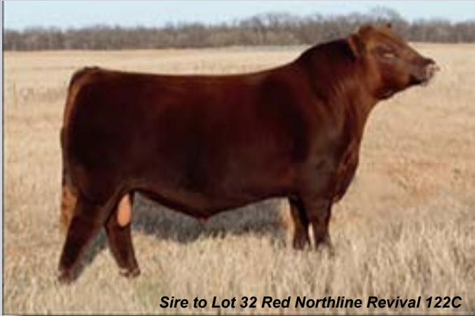
Sire to Lot 32 Red Northline Revival 122C

F620 is sired by 2017 Ft Worth Stock Show Reserve Grand Champion Bull Red Northline Revival. Her dam goes back to Perfect Storm. Both sire and dam bring structure and muscle to their progeny. This heifer calved a very small bull calf, she has a good udder and is producing well that has her bull calf growing well. She is halter broke and easy to work with. If you are looking to add hair quality this female will help.