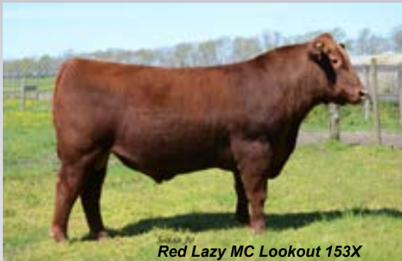
Red Lazy MC Lookout 153X